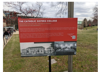
The new sign near the Edward J. Pryzbyla University Center, Catholic University of America