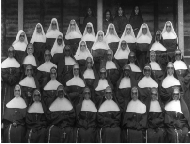
Sisters of the Holy Family, New Orleans, La

Since the earliest introduction of African slaves into the Americas, Black women have played prominent roles in the propagation of Catholic faith, education, and charity. In the 18th century, for example, Black women constituted the majority of the church's membership in New Orleans, Louisiana, and free Black women served as godparents to more than 80 percent of the city's enslaved population.